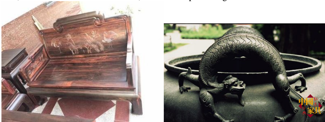
Fig.2. Examples of the Combination of Traditional Culture Patterns and Furniture

No matter what kind of furniture design, we should consider the sustainable development of the whole society. Chinese traditional patterns are complex and diverse, some of which have certain requirements for material selection, such as the use of some rare animal leather, trees. Some also have requirements for materials, such as some require the use of materials with heavy environmental pollution and so on. These are not in line with the concept of environmental protection, for the entire earth environment, is not worth promoting.